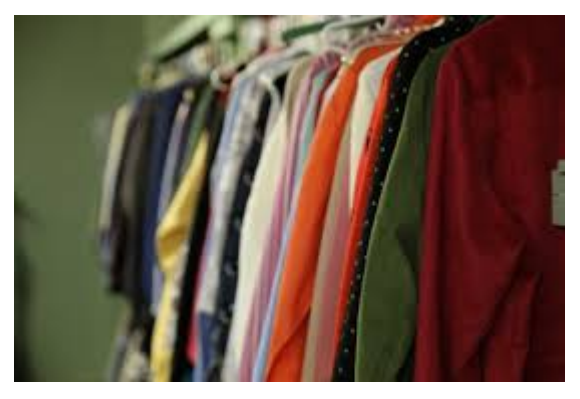
December 16 is Beaumont's Day

Volunteers are needed to help at the PTA Clothes Closet at Madison High School's Marshall campus (SE 91st Avenue) on Monday, December 16 from 9 am to 1 pm . Please sign up to help PPS students find winter jackets, shoes, warm clothes and other necessities. *we still needa couple of volunteers to fulfill our obligation